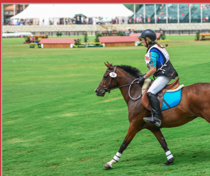
American Eventing Championships on TifTuf ▲