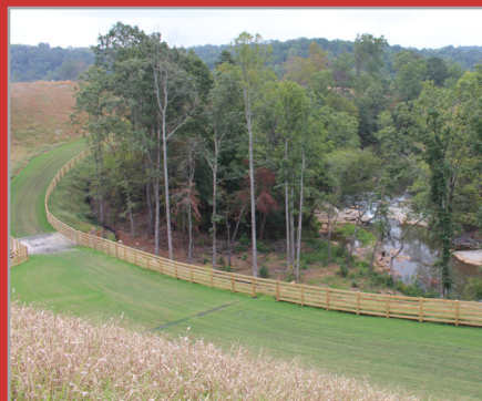
TifTuf course recovery 3 weeks after AEC ▲▲