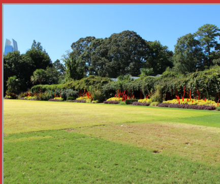
September 28, after 10 days under a tent