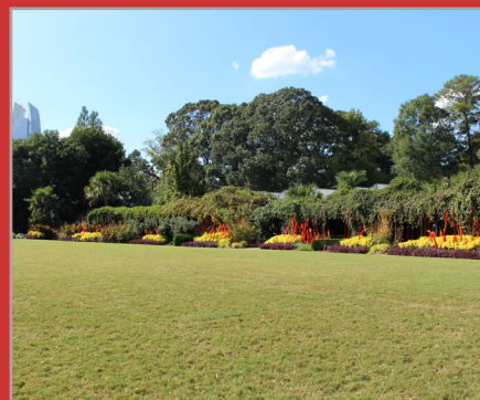
October 19, after three weeks of recovery

The Atlanta Botanical Garden’s Great Lawn is host to numerous events throughout the summer, and the grand finale to this entertainment-heavy schedule is the Garden of Eden Ball in September. A tent covered the TifTuf Bermuda for 10 days, resulting in a yellow lawn. A mere three weeks later, TifTuf had recovered to its green glory, even as it prepared to enter fall dormancy.